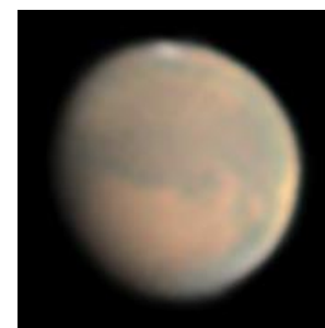
Jul. 14 (293Ls)