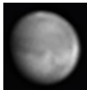
Jul. 12 (292Ls)