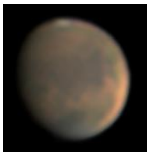
Jul. 10 (291Ls)

The strange phenomenon near Deucalionis Regio (330W~10W,15) that Clyde Foster reported yesterday has developed further today. It seems that the dark pattern was hidden by a dust storm, but the fact that the pattern below is so obscured means that it is a dust storm. However, the date, location and outline of this dust storm are unclear.